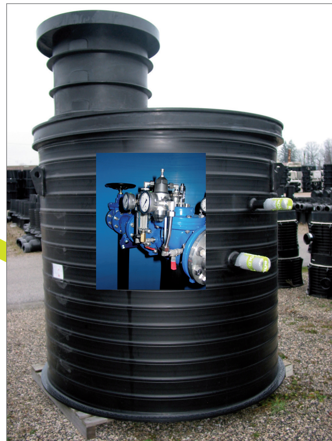
Valve chamber for example. DN 2000