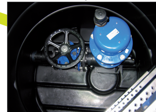
Venting- and exhaust manhole