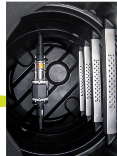
Water meter chamber with MID-measure