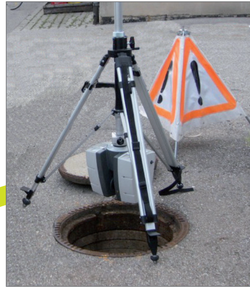
Detailed chamber measurements ideally via chamber scan