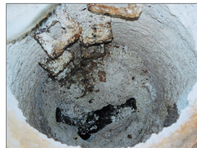
Starting point: corroded concret chamber