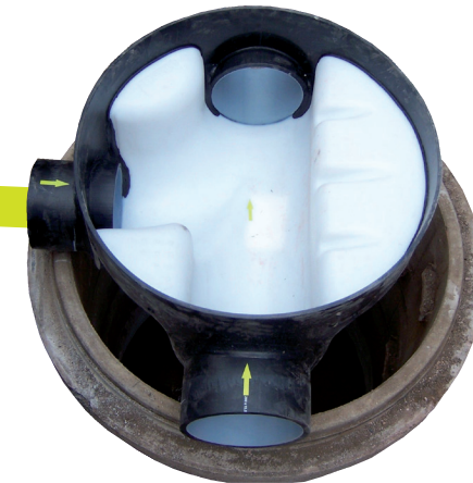
Prefabricated renovation base