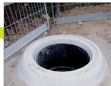
Load decoupled cover