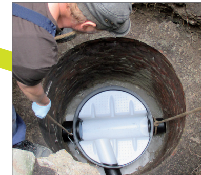
Lower new base into the chamber