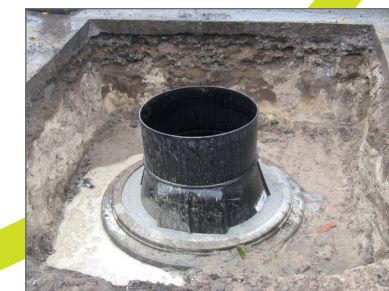
Filling the gap between DN 800 PE chamber and DN 1000 concrete man- hole with filling mortar