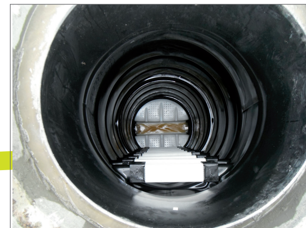
New PE chamber DN 800 in corroded chamber DN 1000