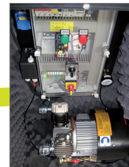
ROMOLD compressor station