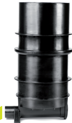
ROMOLD domestic chamber DN 500 to DN 1000

ALL CHAMBERS SUITABLE UP TO CLASS D TRAFFIC LOADS