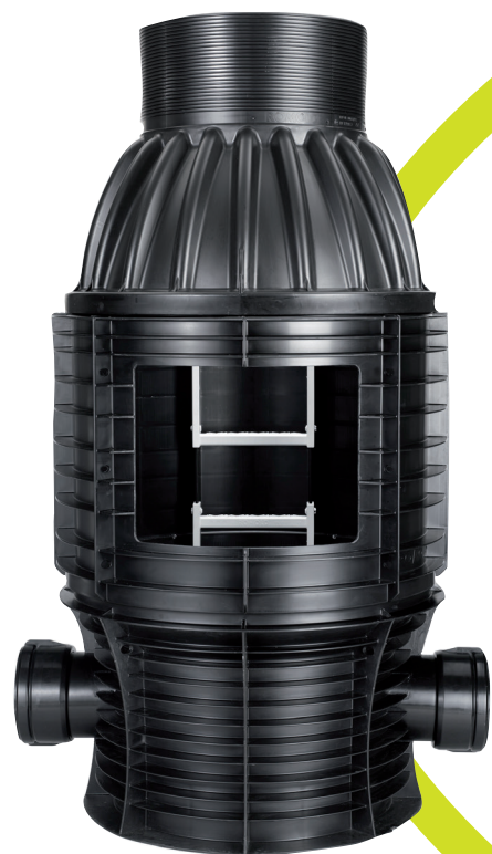
ROMOLD chamber DN 625 to DN 1000