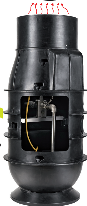
ROMOLD pump stations DN 800 to DN 3600