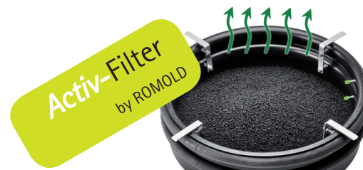
Activ-Filter by ROMOLD