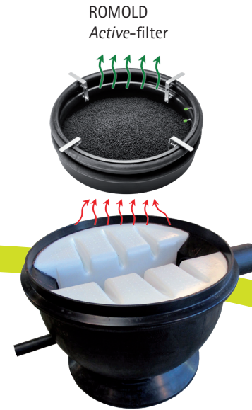
ROMOLD transition chamber