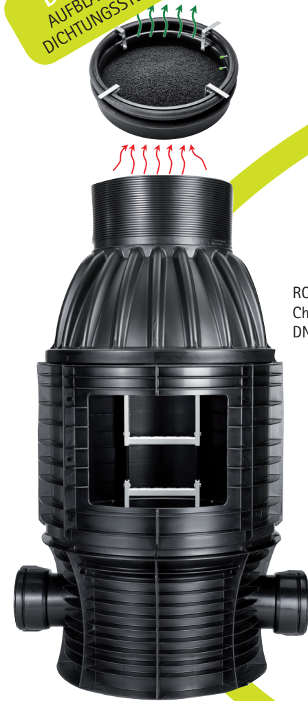
ROMOLD Channel chamber DN 625 to DN 1000