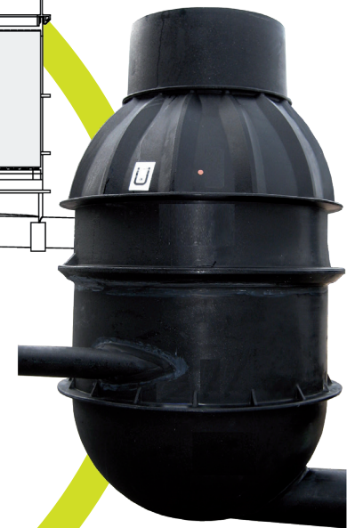
ROMOLD Pressure pipe end chambers